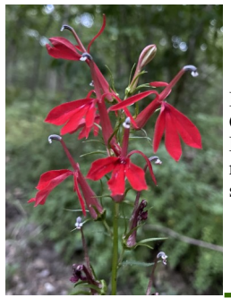
Left, Cardinal Flower, midsummer.