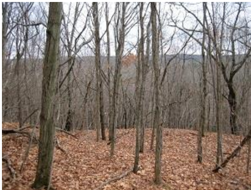
View of the property, which is very hilly.

Starting at the eastern end of Pleasant Street (at the dead end). Rain or shine.