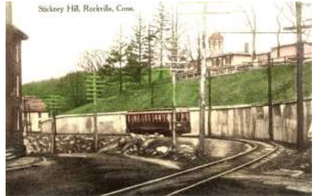
Postcard, when property was called Stickney Hill.