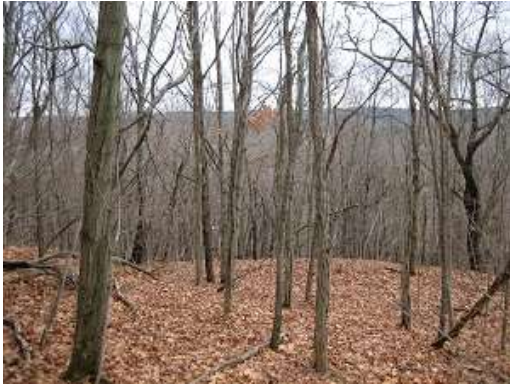
View of the property, which is very hilly.

Eastern end of Pleasant Street (at the dead end). Rain or shine.