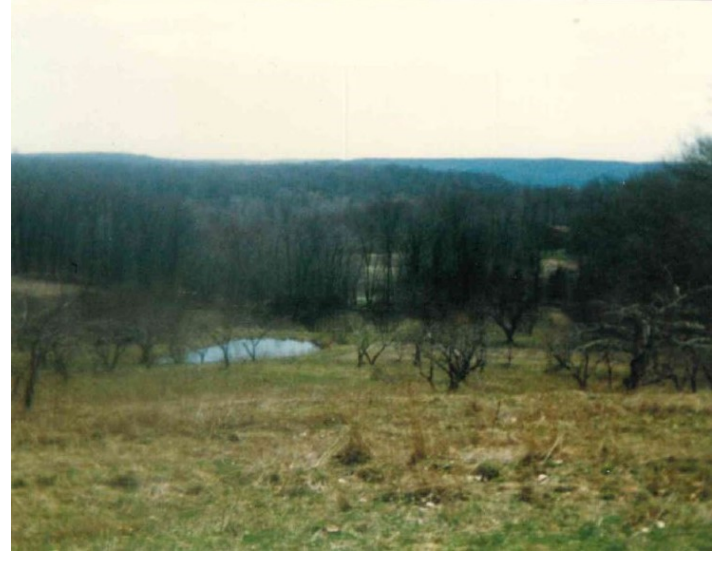
Bush Hill, c. 1990.