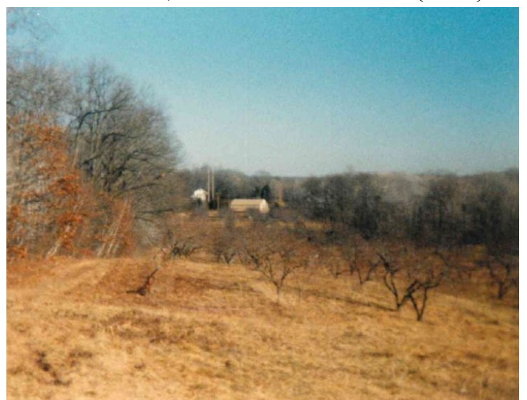
Peach trees, with neighbor's horse, c. 1988