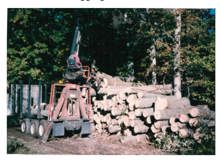
Logging June 2001