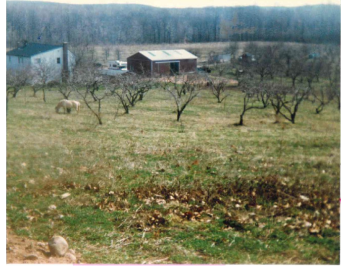
Gerry Botti, hunter's blind c. 1990