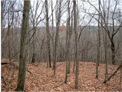
View of the property, which is very hilly.